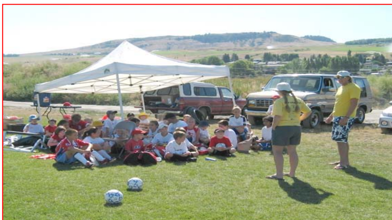
Vernon SunWise Guys in Action

As well, we have been attending all the meetings of the Regional District's Regional Services Committee. This committee is