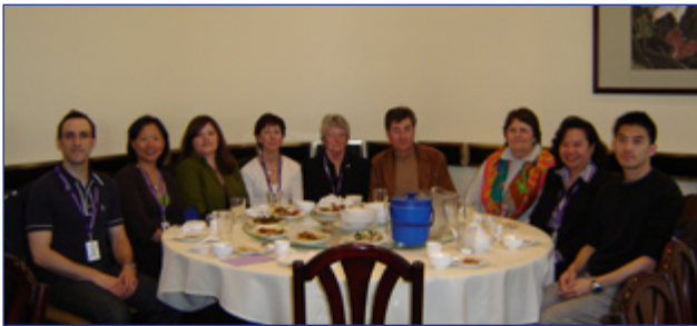
SRC team members celebrate the good news!