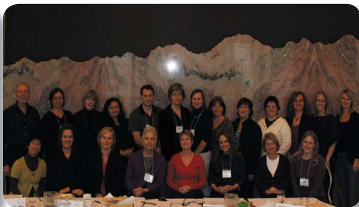
West Canada Participants, Vancouver, November 2009