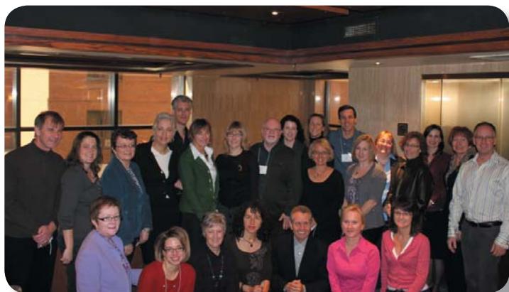
East Canada Participants, Ottawa, October 2009

www.bccancer.bc.ca/RES/ResearchPrograms/SBR/cancertransitions.htm