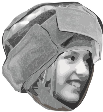
A Cold Cap

Cooling systems are larger units with the caps attached to a refrigeration machine. The machine circulates cool liquid through the cap. The machine has to be plugged in to power for the entire treatment. We do not allow cooling systems at BC Cancer centres. People using cooling systems need longer appointment times and space. If people use large cooling systems, there are fewer treatment spots available.