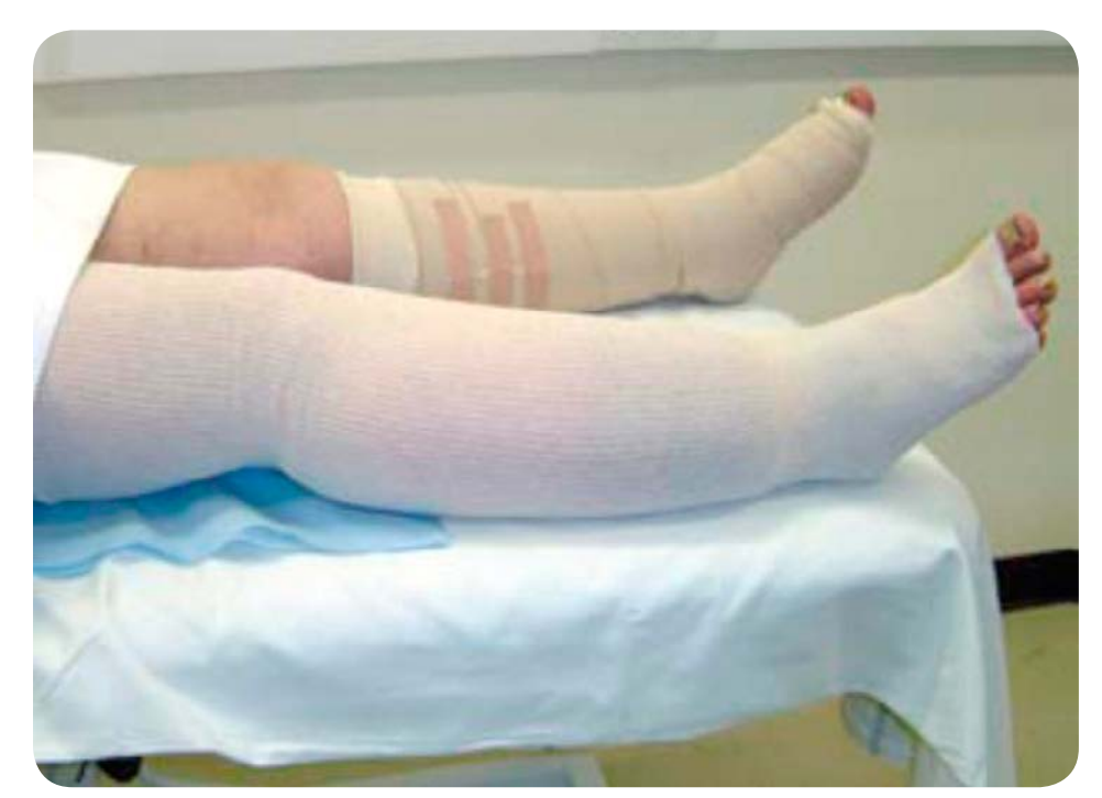
Reproduced with permission from: Lymphoedema Framework, Best Practice for the Management of Lymphoedema, International Consensus, London: MEP LTD, 2006.