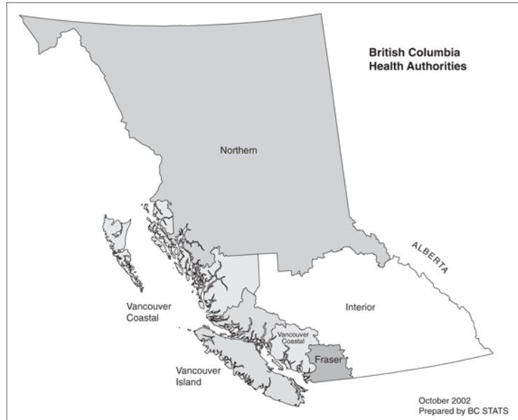
Figure 2-1: Distribution of BC Population i

This section provides a snapshot of the population demographics in the various health regions. The different distributions displayed in the pie-charts in Figure 2-1 and Figure 2-2 illustrates the unique service delivery challenges across the regions with the greatest contrast between NH and FH. FH is responsible for the health of 35% of the population within a service delivery area comprising 2% of the provincial land mass while NH is responsible for the health of 7% of the population across 67% of the provincial land mass. These regional characteristics across our province present unique challenges to every health authority's physical infrastructure. Further comparisons show that some HSDAs have virtually no rural areas while other HSDAs meet the needs of a nearly 50% rural population (Figure 2-3).