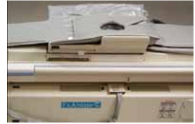
The MRgFUSA device embedded in the MRI table (ExAblate 2000, InSightec, Ltd, Israel)

Focused Ultrasound Ablation (FUSA) for Treatment of Breast Cancer Lumpectomy is the gold standard for surgical treatment of small breast cancers. It can be done as an outpatient procedure, with local anesthetic +/- sedation, with low morbidity, outstanding local control and good-to-excellent cosmesis in 90% of patients. Therefore the bar is high for treatments that may supplant it. One modality for the future is MRI guided, FUSA. It is a non-invasive, ambulatory, single session technique that does not require a temperature mapping probe. To date there are a small number of small studies. This is a technique which requires complex technology with currently very limited availability. However, nonsurgical ablative cancer therapies will become more commonplace in future. FUSA is now the subject of an FDA approved trial (David Brenin, Division of Surgical Oncology, University of Virginia).