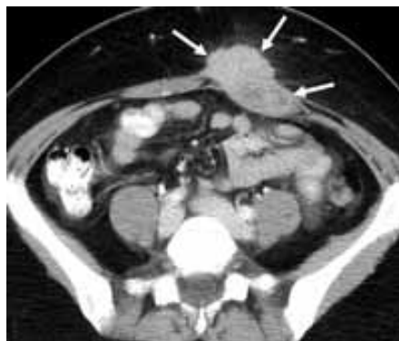
Abdominal Wall Desmoid