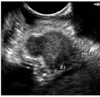
Endoscopic Image and EUS. Left: Ulcerated submucosalmass in gastric body. Right: Irregular homogenoussubmucosal mass.

Mutation analysis shows different sensitivity to imatininb as a function of the type of mutation and is important in the management of patients with recurrent/metastatic disease, particularly if they are not responding to treatment. Dose escalation is effective in the setting of certain mutations. Assessing the response to treatment can be challenging as simple measurements of tumour size is not reliable. Changes in density or loss of FDG uptake on PET are more suitable for these tumours.